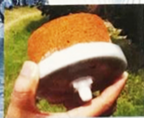
PURO ® Terafil Disc Size dimension :- 100 mm X 50 mm.