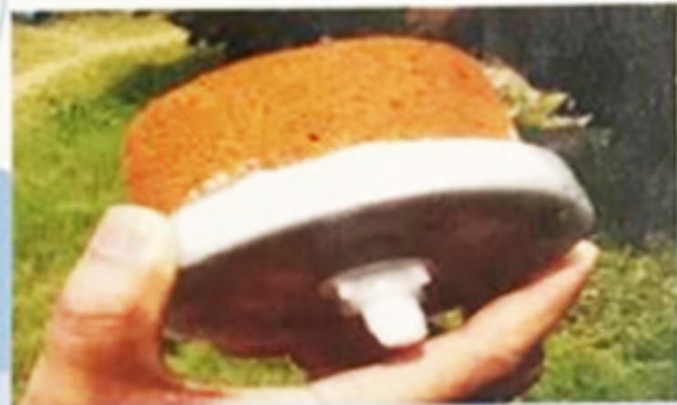
PURO ® Terafil Disc Size dimension :- 220 mm X 50 mm.